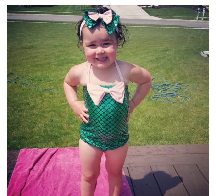
3 Submitted by Ashley Brodd