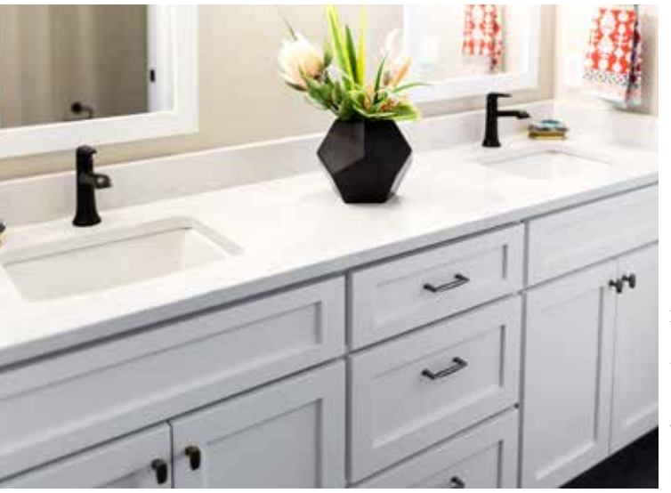
eatures from a similar mode