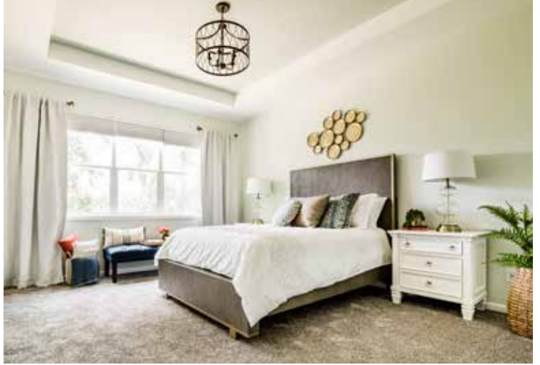
nis c most source