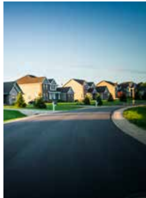
Photos are representative, not actual photos at Village at Autumn Lake.