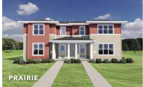
*Varies by elevation

WE MAKE BUILDING EASY.® When you build a Veridian home, you get much more than a home designed around you and your dreams. You get the peace of mind that comes with nationally-recognized, award-winning, quality craftsmanship and energy efficiency. You get a home that's constructed using innovative building materials as well as the newest technology and building practices. The result is a high-performing, green and energy efficient home that's a healthier home for you and your pocketbook. And when you build with Veridian Homes, you build with a team of specifically trained experts who make homebuilding easy.