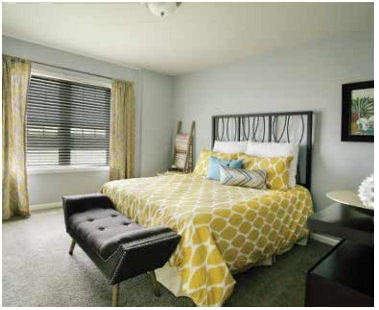
eatures from a similar mo