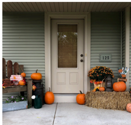
2 Submitted by Bobbie Colvin