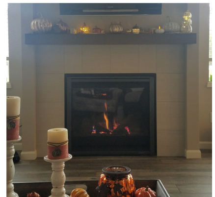
3 Submitted by Kelly Mumm