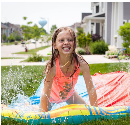
1 Submitted by Laura Nagler