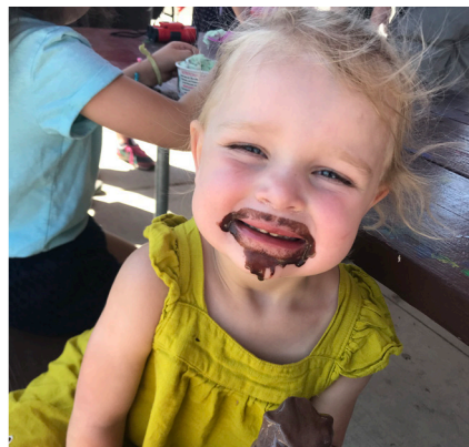
2 Submitted by Ashley Brodd