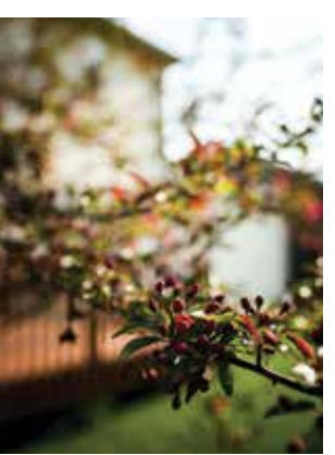
Photos are representative, not actual photos at Birchwood Point South.