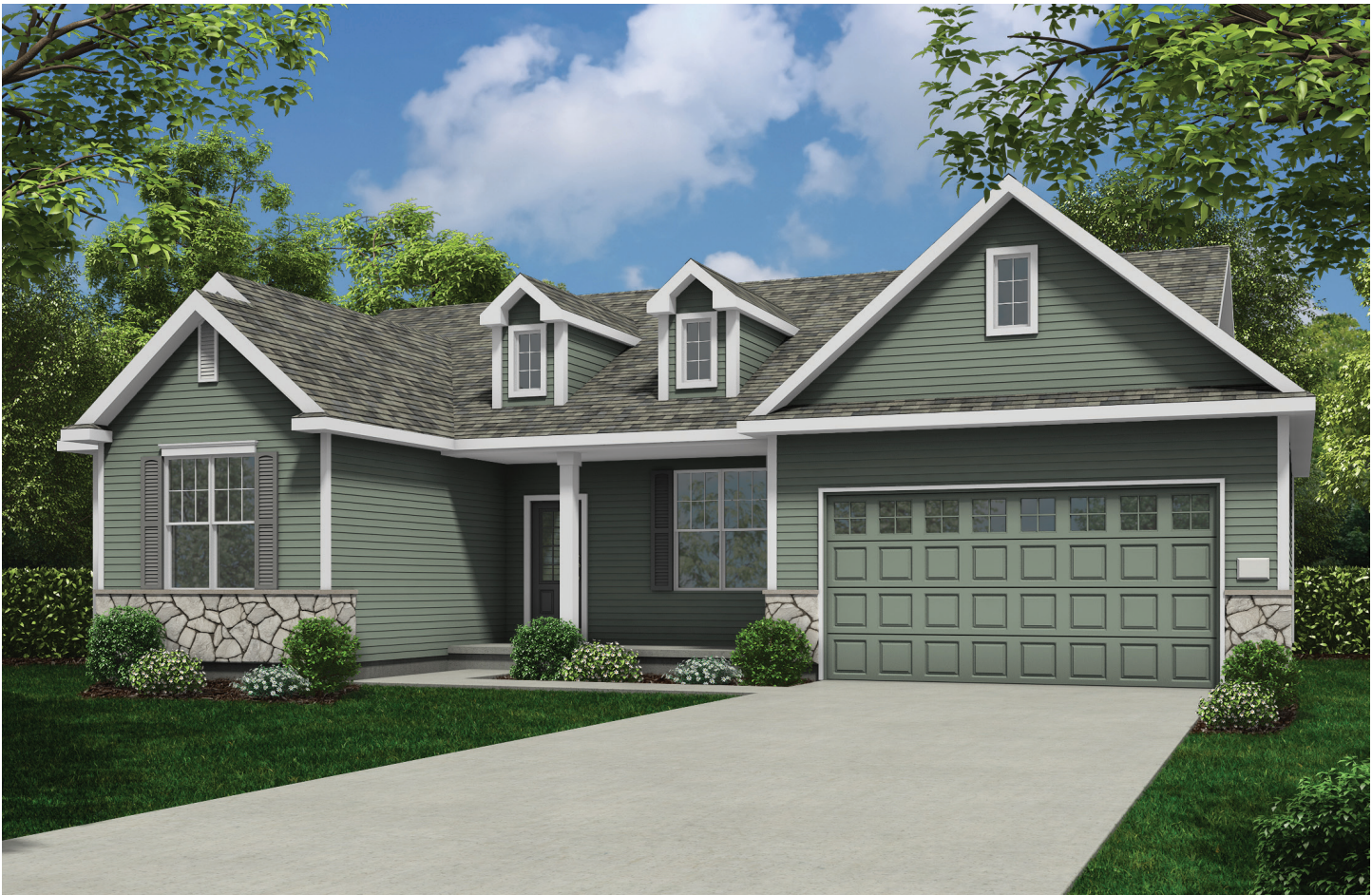
*Varies by elevation

3 BEDROOMS • 2 BATHROOMS • 1,764 SQUARE FEET*