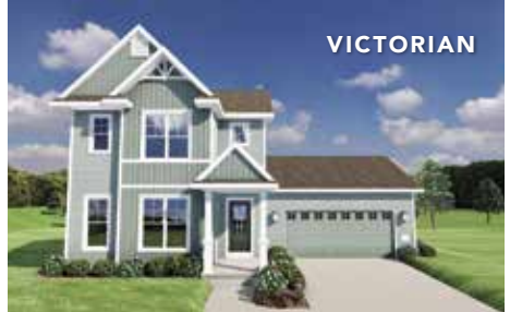
*Varies by elevation

WE MAKE BUILDING EASY.® When you build a Veridian home, you get much more than a home designed around you and your dreams. You get the peace of mind that comes with nationally-recognized, award-winning, quality craftsmanship and energy efficiency. You get a home that's constructed using innovative building materials as well as the newest technology and building practices. The result is a high-performing, green and energy efficient home that's a healthier home for you and your pocketbook. And when you build with Veridian Homes, you build with a team of specifically trained experts who make homebuilding easy.