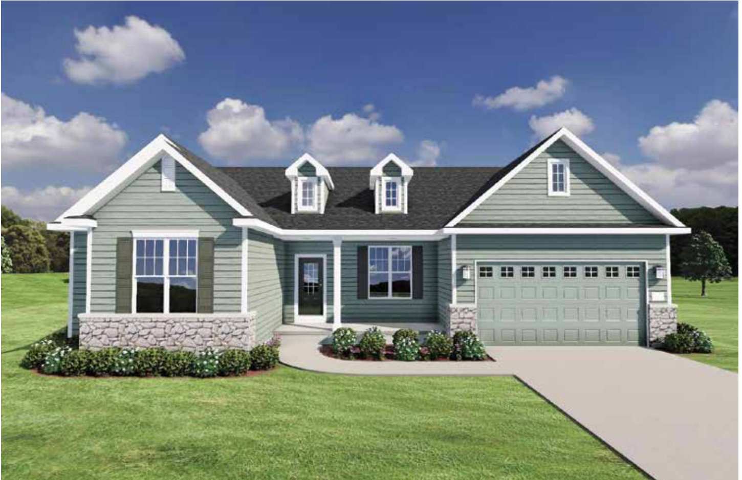
*Varies by elevation

3 BEDROOMS · 2 BATHROOMS · 1,764 SQUARE FEET*