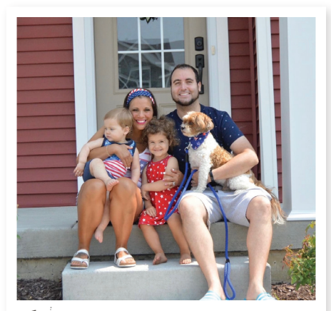
Submitted by Jaclyn Bozile