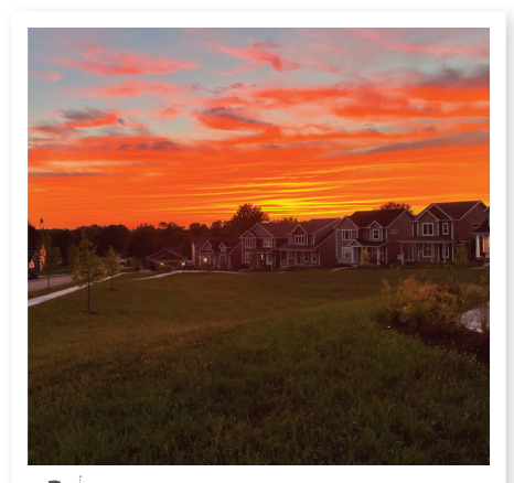
3 Submitted by Leigh Fredericks