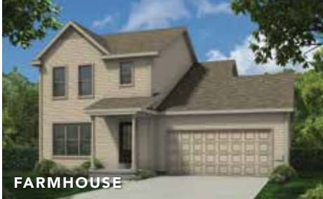
*Varies by elevation

WE MAKE BUILDING EASY.® When you build a Veridian home, you get much more than a home designed around you and your dreams. You get the peace of mind that comes with nationally-recognized, award-winning, quality craftsmanship and energy efficiency. You get a home that's constructed using innovative building materials as well as the newest technology and building practices. The result is a high-performing, green and energy efficient home that's a healthier home for you and your pocketbook. And when you build with Veridian Homes, you build with a team of specifically trained experts who make homebuilding easy.