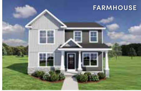
*Exterior design, square footage and product selections may vary by elevation and neighborhood.

WE MAKE BUILDING EASY. When you build a Veridian home, you get much more than a home designed around you and your dreams. You get the peace of mind that comes with nationally-recognized, award-winning, quality craftsmanship and energy efficiency. You get a home that's constructed using innovative building materials as well as the newest technology and building practices. The result is a high-performing, green and energy efficient home that's a healthier home for you and your pocketbook. And when you build with Veridian Homes, you build with a team of specifically trained experts who make homebuilding easy.