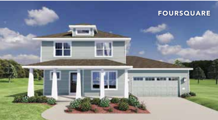
*Varies by elevation

WE MAKE BUILDING EASY.® When you build a Veridian home, you get much more than a home designed around you and your dreams. You get the peace of mind that comes with nationally-recognized, award-winning, quality craftsmanship and energy efficiency. You get a home that's constructed using innovative building materials as well as the newest technology and building practices. The result is a high-performing, green and energy efficient home that's a healthier home for you and your pocketbook. And when you build with Veridian Homes, you build with a team of specifically trained experts who make homebuilding easy.