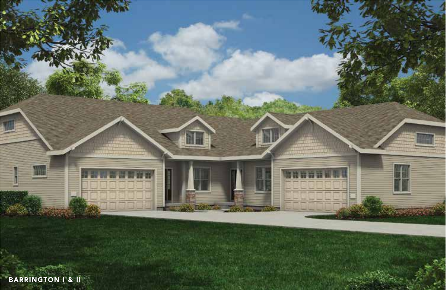
BARRINGTON I & II

3 BEDROOMS · 2 BATHROOMS · 1,780 SQUARE FEET*