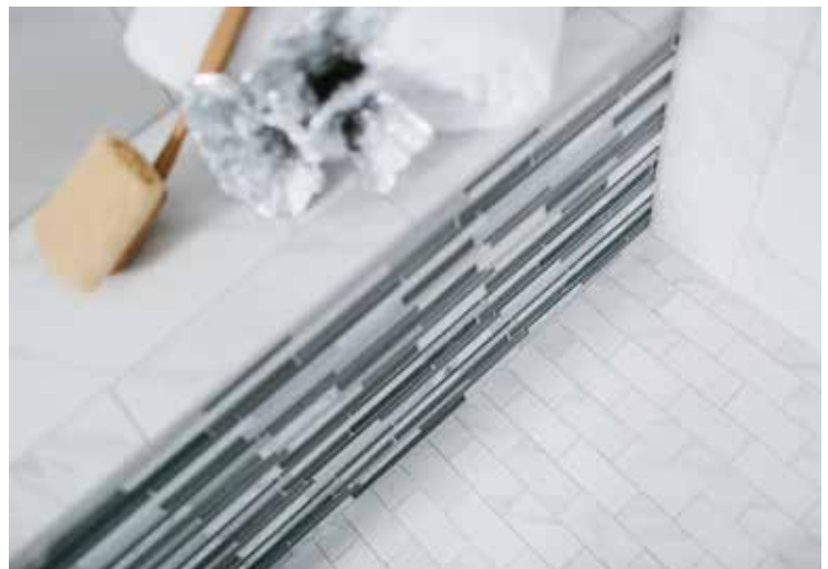
*Features from a similar model