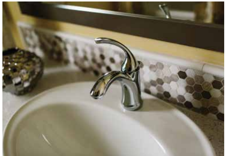
*Features from a similar model