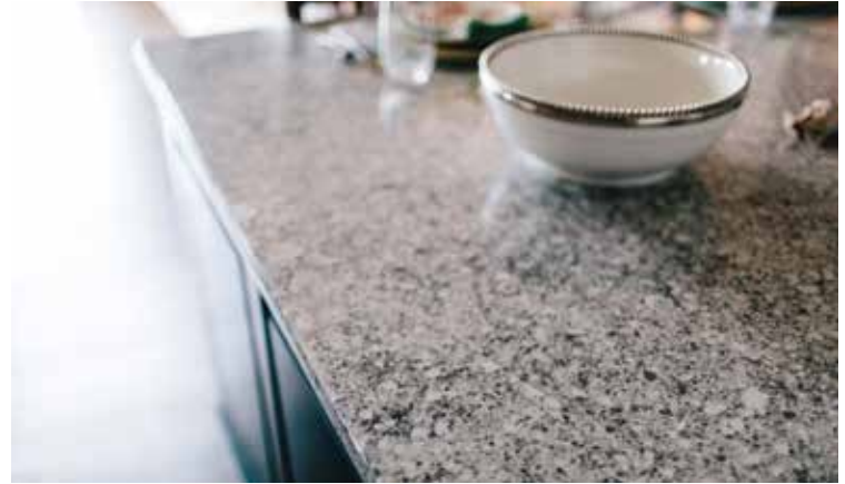
*Features from a similar model