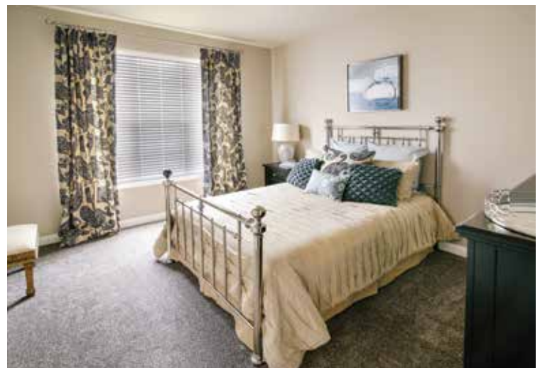
*Features from a similar model