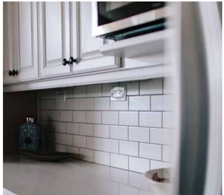
*Features from a similar model