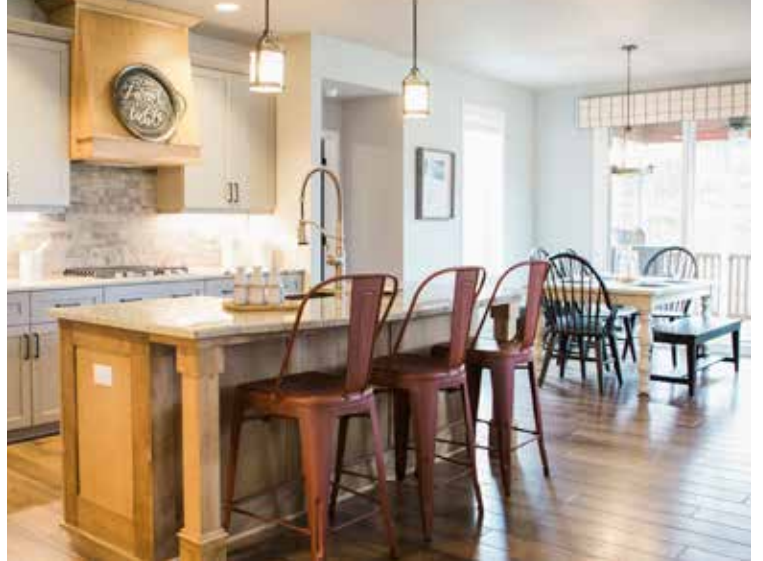
eatures from a similar

CERTIFIED HIGH-PERFORMING HOMES BUILDING ENERGY EFFICIENT, GREEN HOMES SINCE 2001