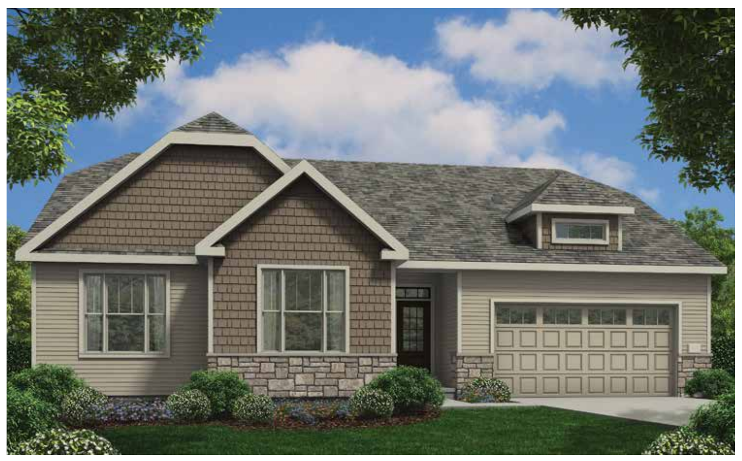
*Varies by elevation

3 BEDROOMS · 2 BATHROOMS · 1,841 SQUARE FEET*