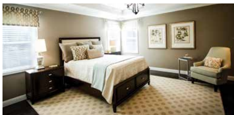
*Features from a similar model

CERTIFIED HIGH-PERFORMING HOMES BUILDING ENERGY EFFICIENT, GREEN HOMES SINCE 2001