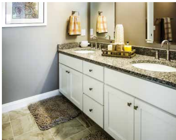
*Features from a similar model