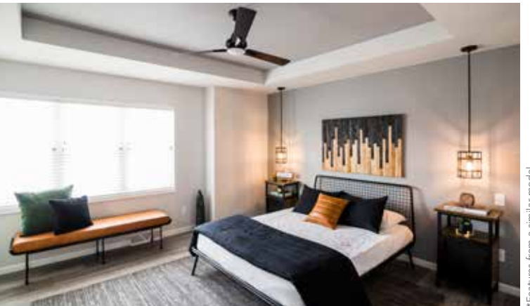
satures from a simil

CERTIFIED HIGH-PERFORMING HOMES BUILDING ENERGY EFFICIENT, GREEN HOMES SINCE 2001