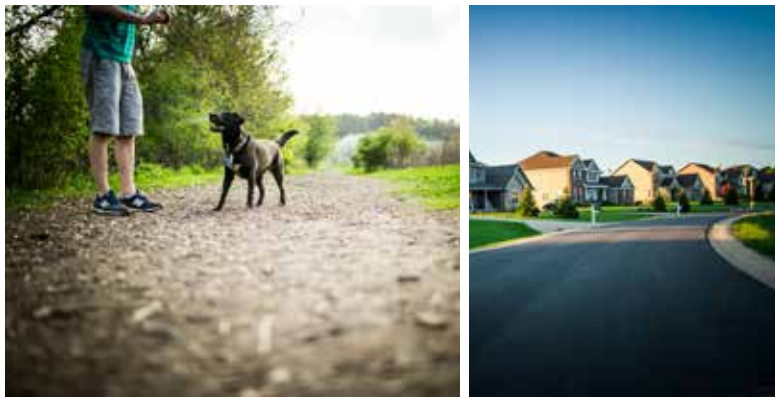
Photos are representative, not actual photos at Village at Autumn Lake.