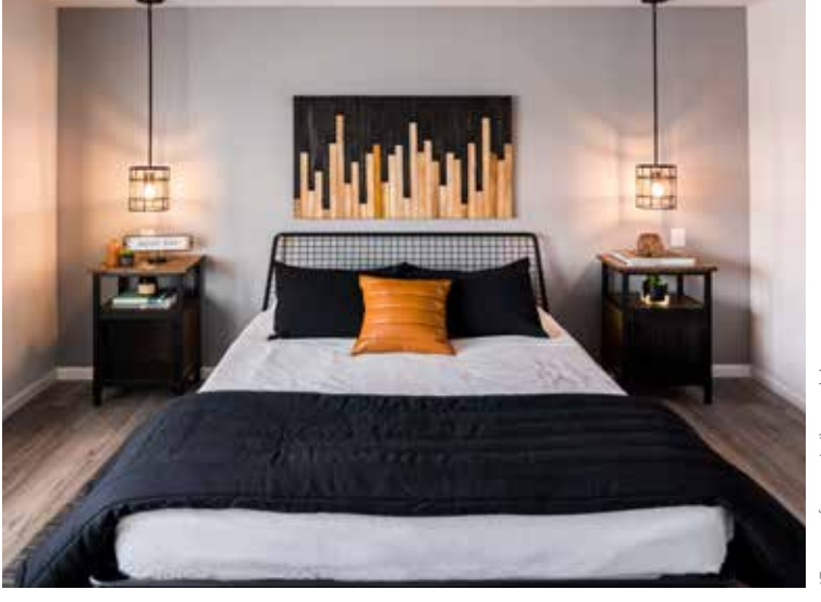
eatures from a simila