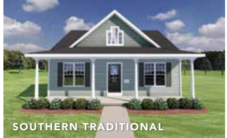
*Varies by elevation

WE MAKE BUILDING EASY.®. When you build a Veridian home, you get much more than a home designed around you and your dreams. You get the peace of mind that comes with nationally-recognized, award-winning, quality craftsmanship and energy efficiency. You get a home that's constructed using innovative building materials as well as the newest technology and building practices. The result is a high-performing, green and energy efficient home that's a healthier home for you and your pocketbook. And when you build with Veridian Homes, you build with a team of specifically trained experts who make homebuilding easy.