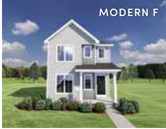
*Exterior design, square footage and product selections may vary by elevation and neighborhood.

WE MAKE BUILDING EASY. When you build a Veridian home, you get much more than a home designed around you and your dreams. You get the peace of mind that comes with nationally-recognized, award-winning, quality craftsmanship and energy efficiency. You get a home that's constructed using innovative building materials as well as the newest technology and building practices. The result is a high-performing, green and energy efficient home that's a healthier home for you and your pocketbook. And when you build with Veridian Homes, you build with a team of specifically trained experts who make homebuilding easy.