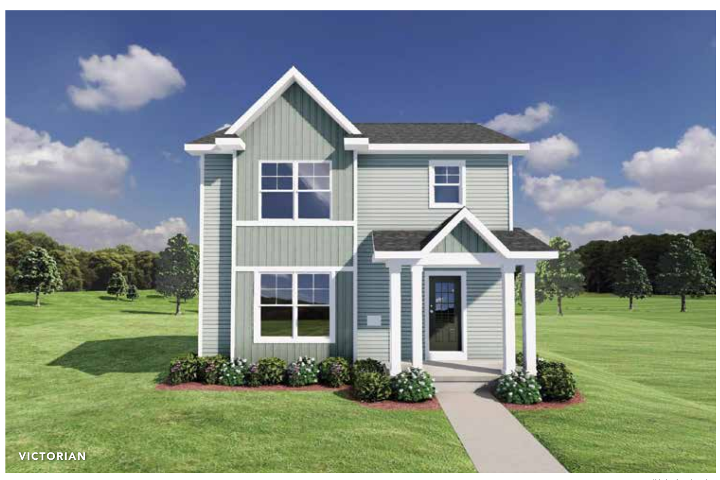
*Varies by elevation

3 BEDROOMS · 2.5 BATHROOMS · 1,520 SQUARE FEET*