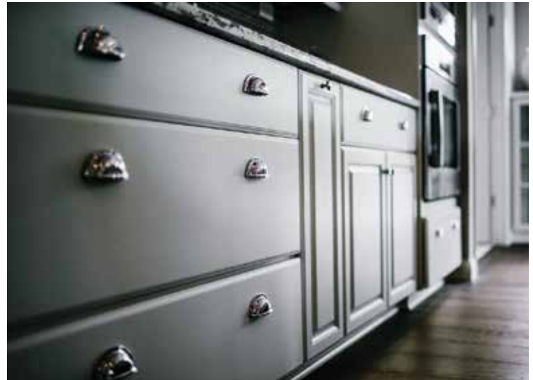
*Features from a similar model