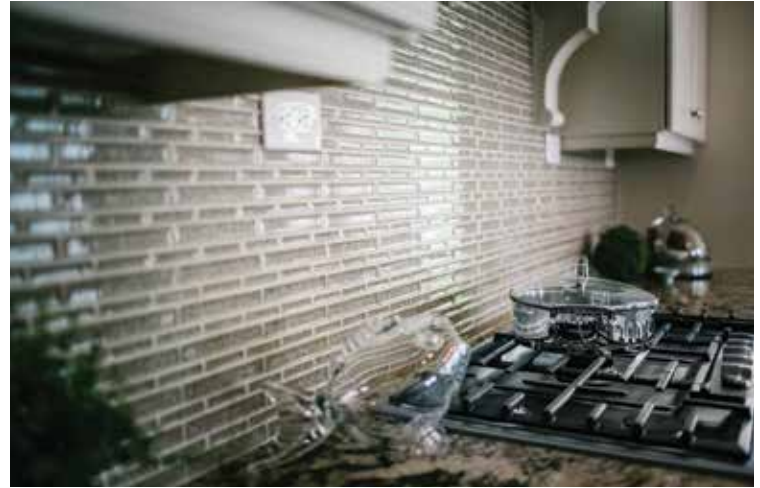
*Features from a similar model