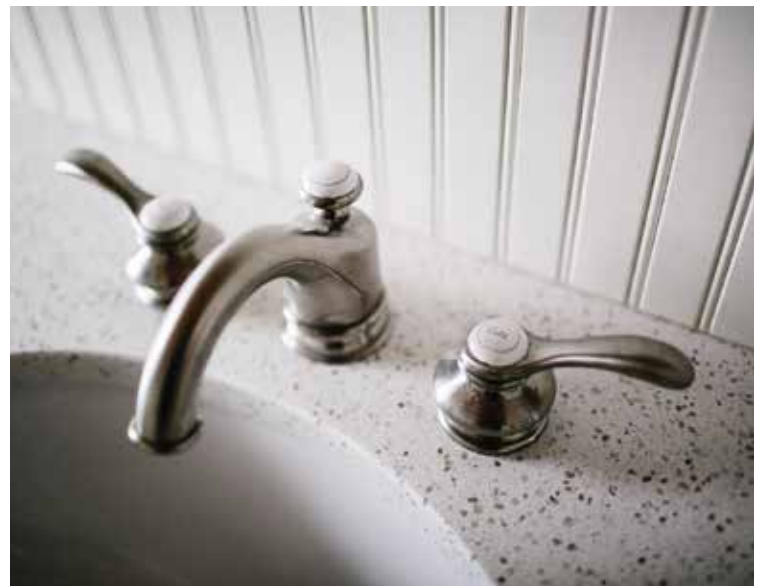
*Features from a similar model