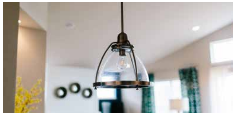
*Features from a similar model

CERTIFIED HIGH-PERFORMING HOMES BUILDING ENERGY EFFICIENT, GREEN HOMES SINCE 2001