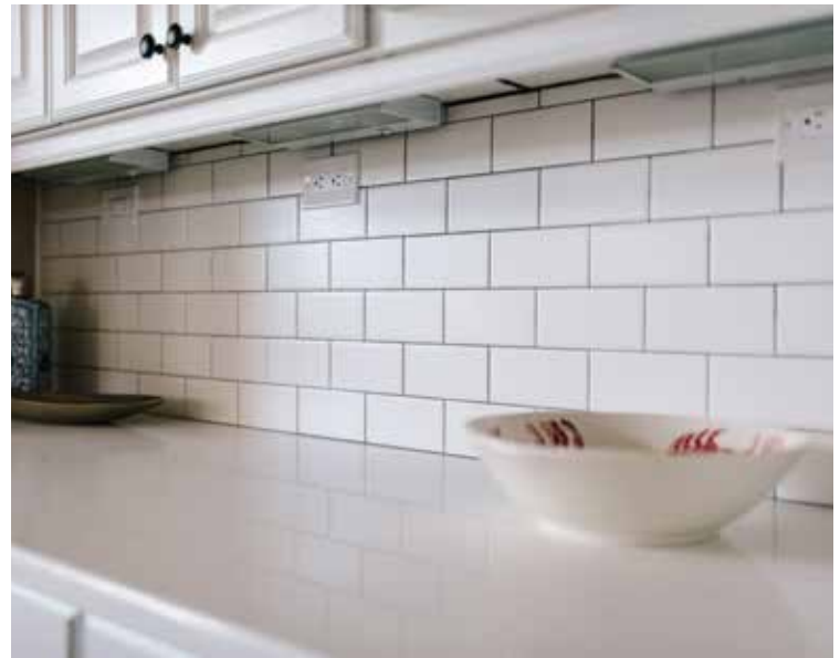
*Features from a similar model