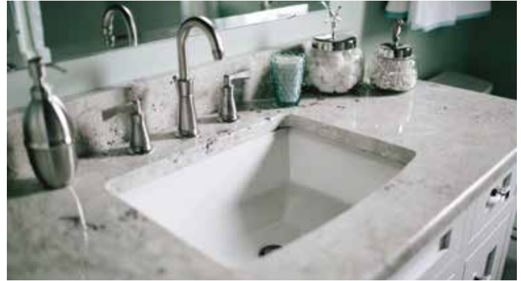
*Features from a similar model