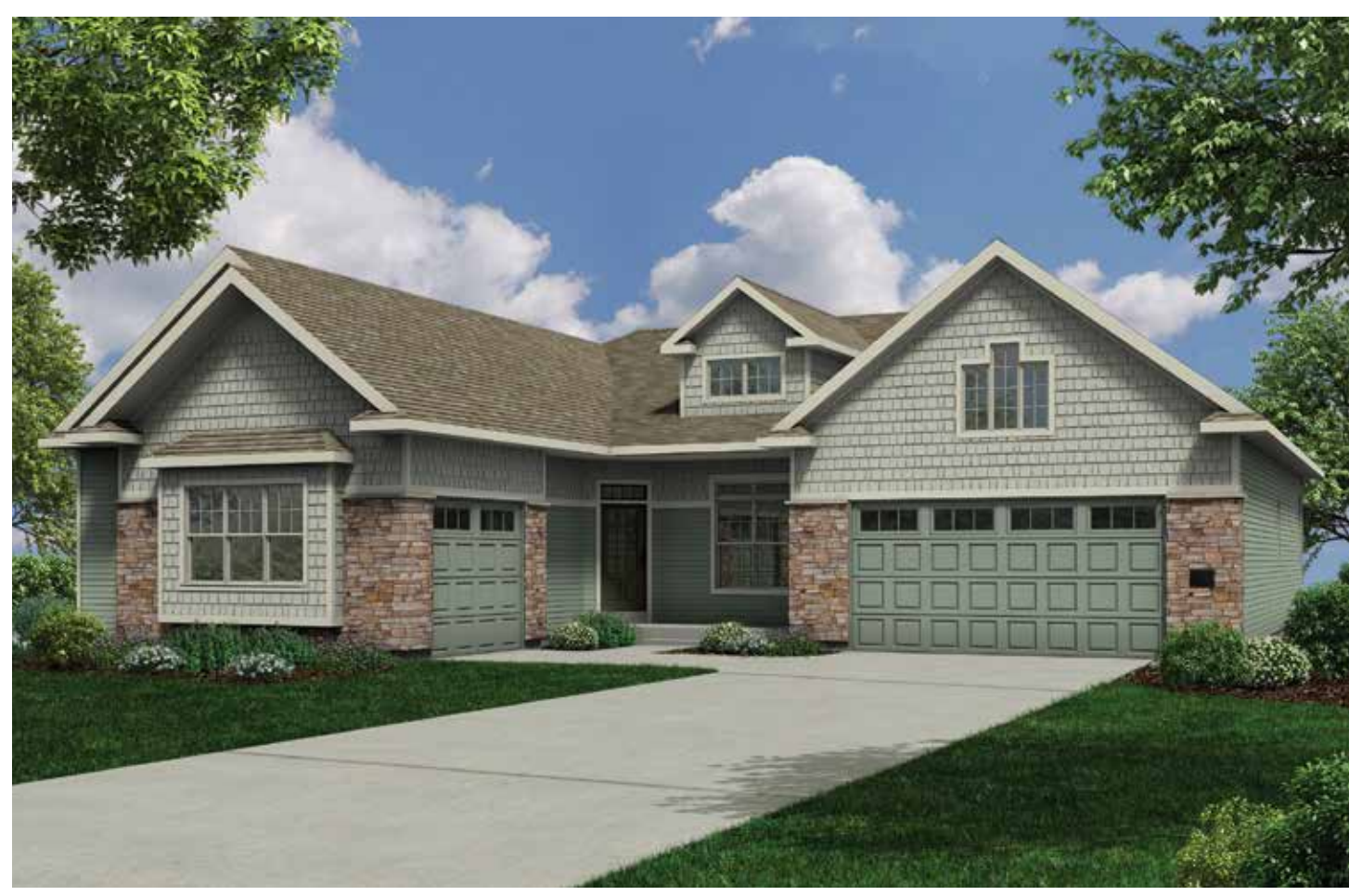
*Varies by elevation

3 BEDROOMS · 2 BATHROOMS · 2,208 SQUARE FEET*