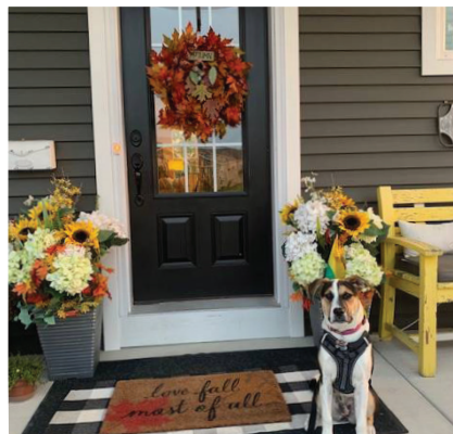
2 Submitted by Kristin DeLorme