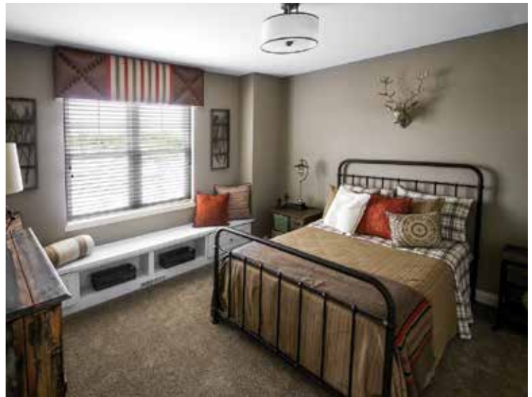
*Features from a similar model

CERTIFIED HIGH-PERFORMING HOMES BUILDING ENERGY EFFICIENT, GREEN HOMES SINCE 2001