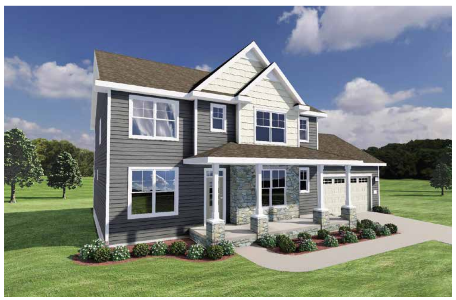
*Varies by elevation

4 BEDROOMS · 2.5 BATHROOMS · 2,781 SQUARE FEET*