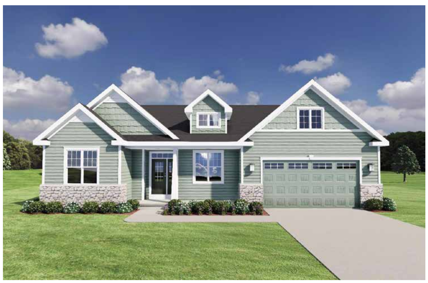
*Varies by elevation

3 BEDROOMS · 2 BATHROOMS · 1,974 SQUARE FEET*