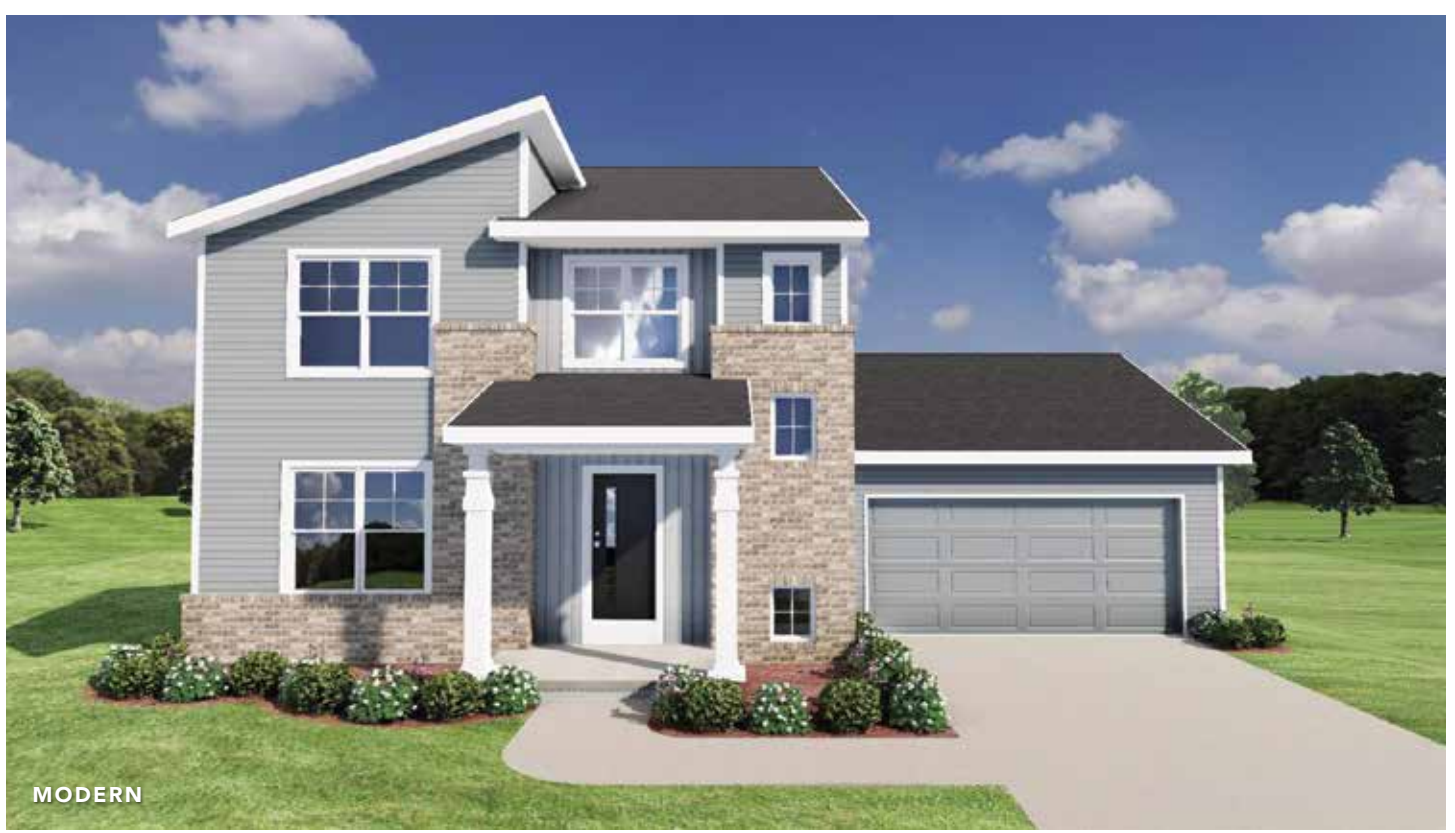
Varies by elevation