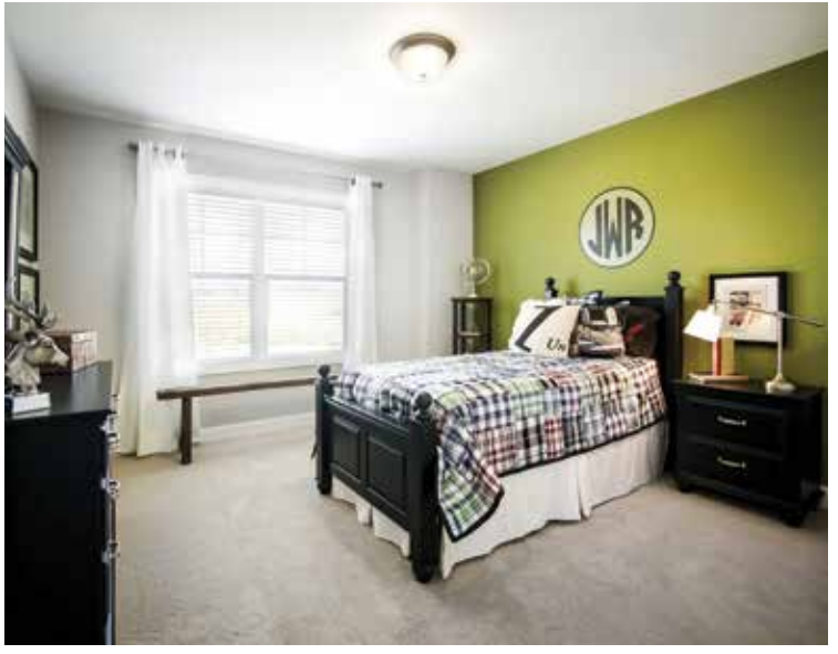
eature from a cim