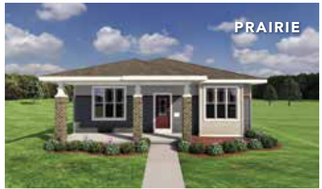
*Varies by elevation

WE MAKE BUILDING EASY.® When you build a Veridian home, you get much more than a home designed around you and your dreams. You get the peace of mind that comes with nationally-recognized, award-winning, quality craftsmanship and energy efficiency. You get a home that's constructed using innovative building materials as well as the newest technology and building practices. The result is a high-performing, green and energy efficient home that's a healthier home for you and your pocketbook. And when you build with Veridian Homes, you build with a team of specifically trained experts who make homebuilding easy.