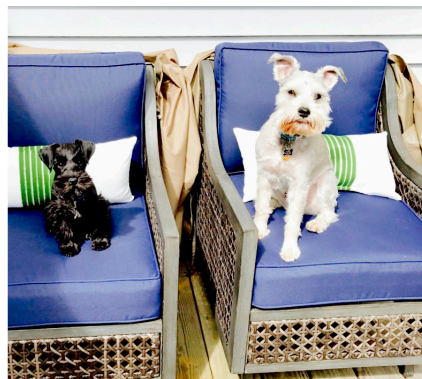
2 Submitted by Dana Murn-Kohal