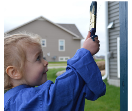
3