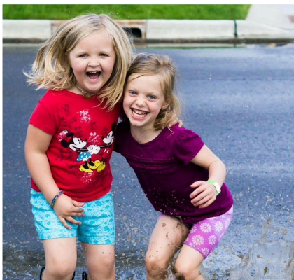
1 Submitted by Sara Berg