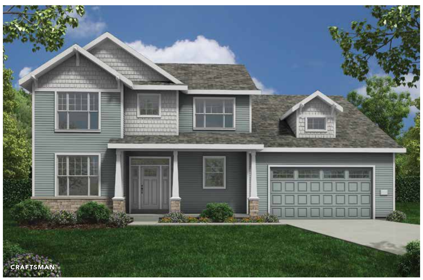
*Varies by elevation

4 BEDROOMS · 3.5 BATHROOMS · 2,898 SQUARE FEET*