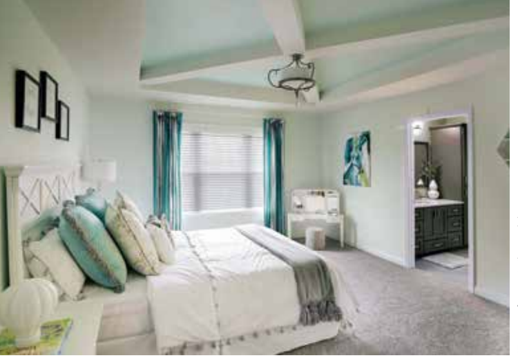
atures from a similar