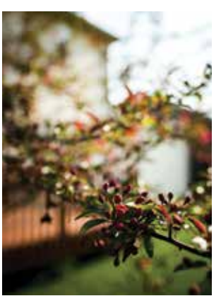
Photos are representative, not actual photos at Birchwood Point South.