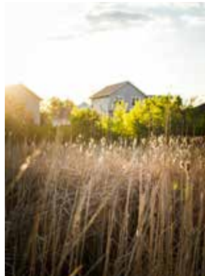
Photos are representative, not actual photos at The Meadows at Conservancy Place.