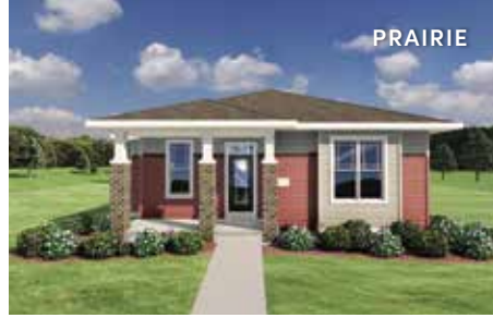
*Exterior design, square footage and product selections may vary by elevation and neighborhood.

WE MAKE BUILDING EASY. When you build a Veridian home, you get much more than a home designed around you and your dreams. You get the peace of mind that comes with nationally-recognized, award-winning, quality craftsmanship and energy efficiency. You get a home that's constructed using innovative building materials as well as the newest technology and building practices. The result is a high-performing, green and energy efficient home that's a healthier home for you and your pocketbook. And when you build with Veridian Homes, you build with a team of specifically trained experts who make homebuilding easy.